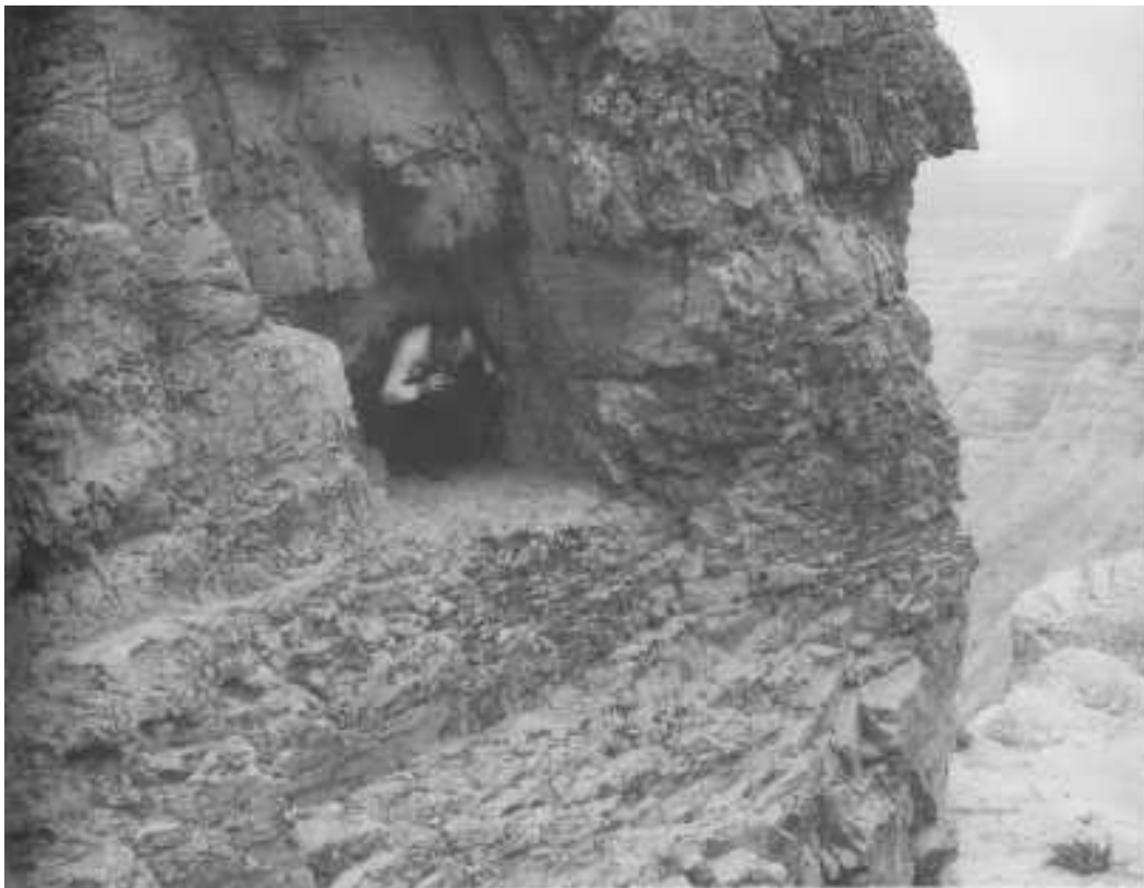
34 The water supply to Qumran depended upon this water tunnel carved through solid rock