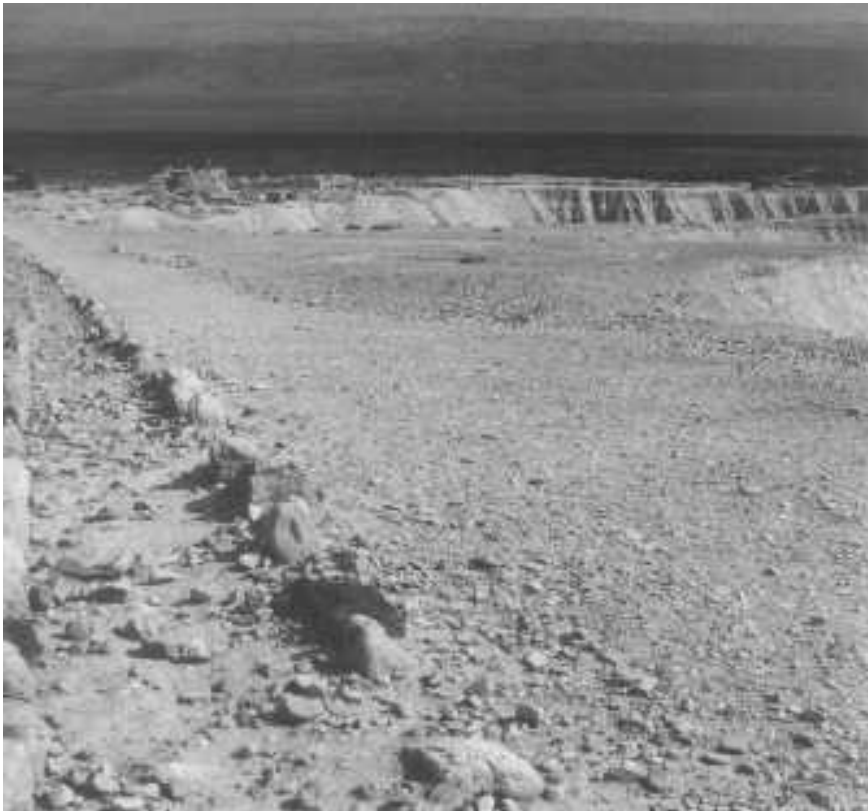
32 Remains of the main waterway into the Qumran community. The site had a complex water system fed from seasonal water flowing in the Wadi behind the ruins.

of the circular weapons forge, to the left of which part of the water conduit has been exposed.