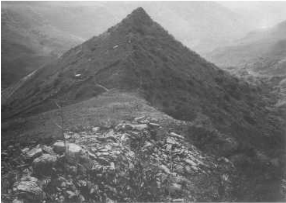
39 The pyramidal hill at Gamla in the Golan where the final citadel stood. Here, on 10 November 67 AD, 4,000 zealots died fighting the Romans and another 5,000 killed themselves by jumping over the cliff. The Dead Sea Scrolls provide an insight into the rationale which lay behind the mass suicides.