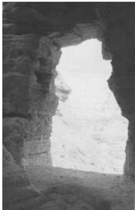
30 The interior of Cave 4, Qumran, where the largest number of fragments