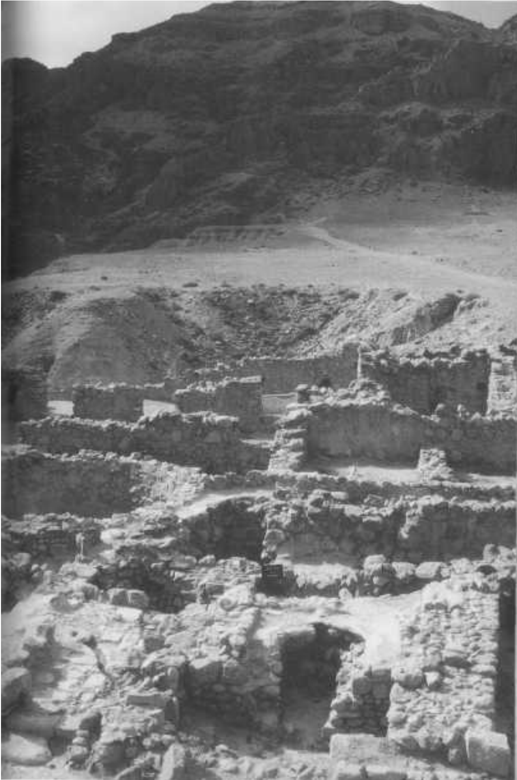
31 The Qumran ruins from the fortified tower. In the foreground are the remains

were discovered in 1952. Fragments of up to 800 different scrolls were retrieved.