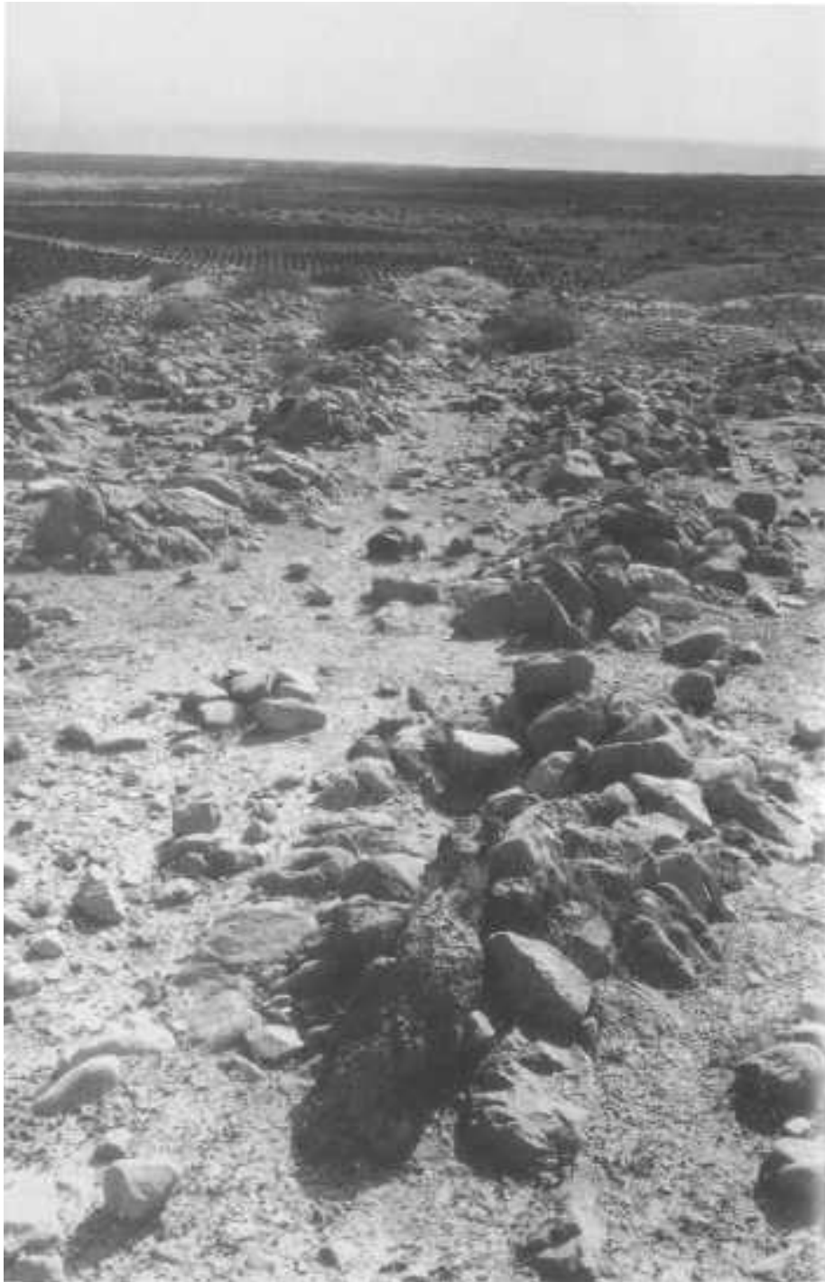
36 Several of the 1,200 or so rock-covered graves slightly to the east of the ruins. Aligned north-south, contrary to normal Jewish practice, the graves appear to be unique to the Qumran-type of community. A small number of graves has been opened, and the remains of men, women and children found