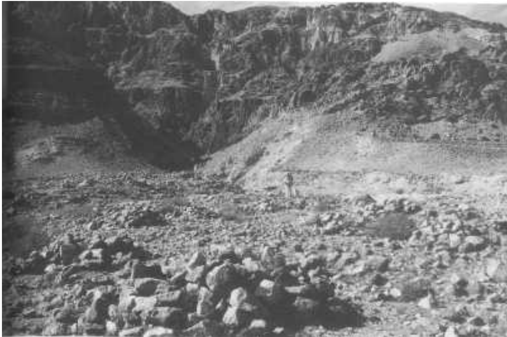
37 A dozen or so Qumran-type graves - aligned north—south - have been discovered some nine miles south of Qumran, at En el-Ghuweir. Clearly there was a settlement also on this site.

The caves in the Wadi and cliffs behind may well have served as repositories for the same type of scrolls as were found near Qumran.