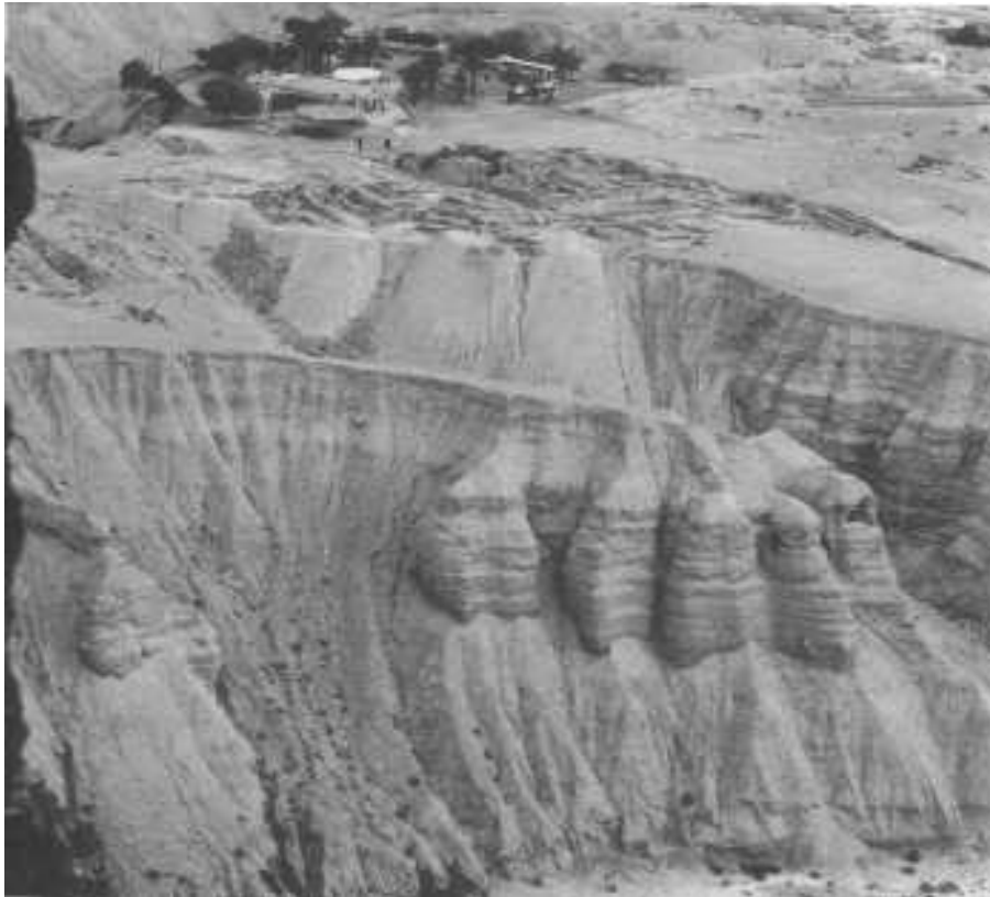
29 The ruins of Qumran. Caves 4 and 5 can be seen at the end of the nearer eroded cliff-face.