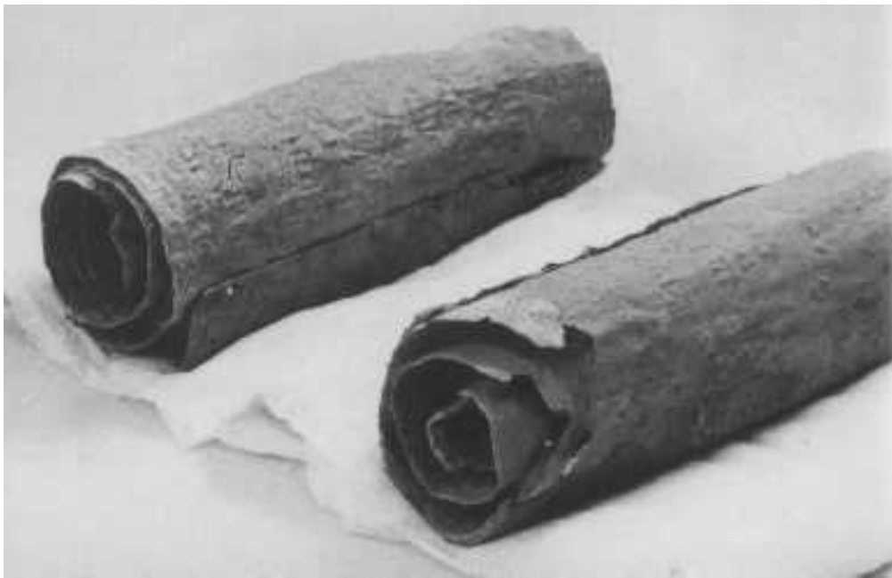
15 The unopened 'Copper Scroll', found broken into two sections in Cave 3 in 1952.

Among the scholars of Father de Vaux's original international team, perhaps the most dynamic, original and audacious was John Marco Allegro. Certainly he was