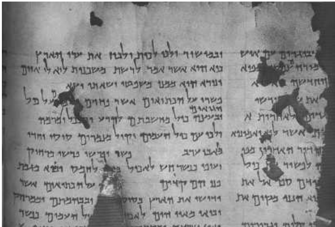
5 A portion of one of the scrolls, the 'Habakkuk Commentary', which tells of a battle between the leader of the Dead Sea community and two opponents, the 'Liar' and the 'Wicked Priest'.