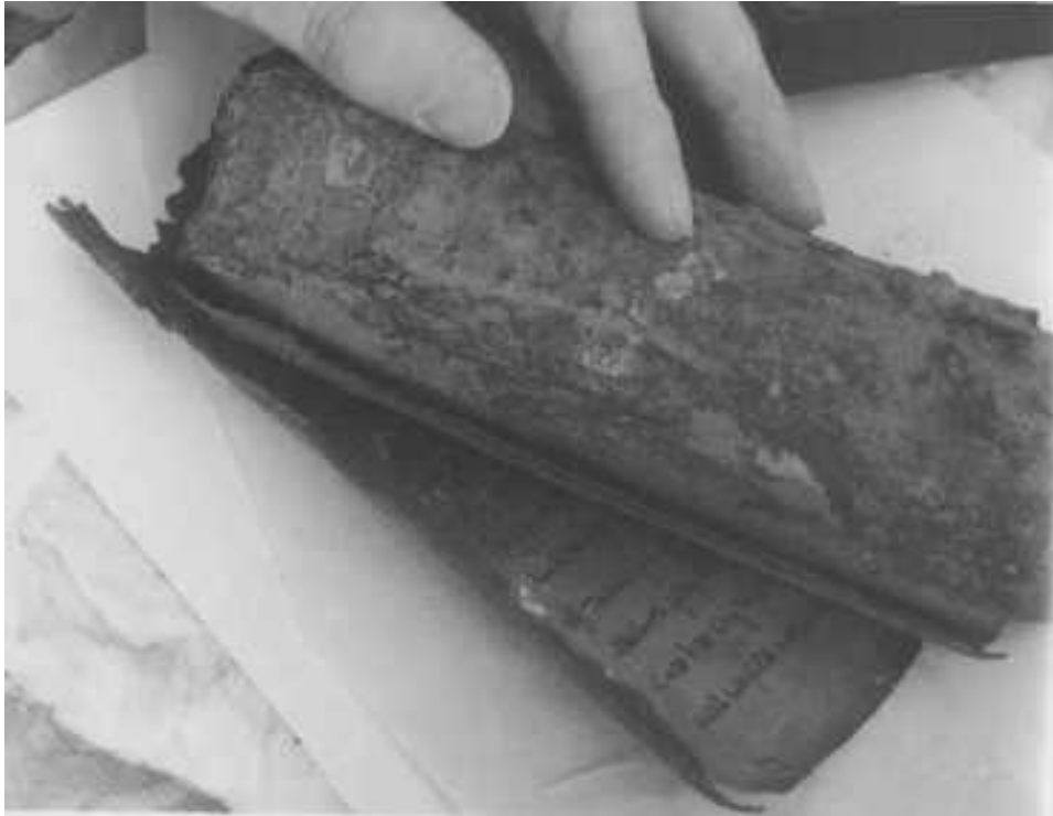
26 The 'Psalms Scroll' from Cave II before it was unrolled.