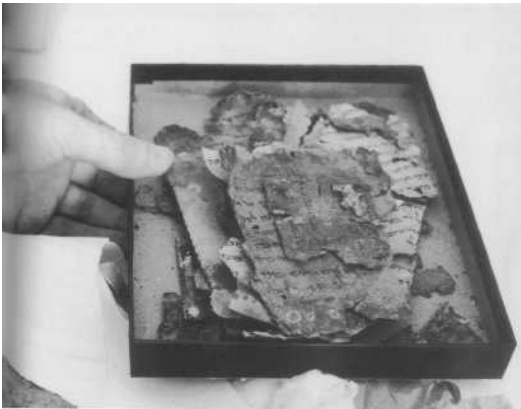
25 Scroll fragments as they were brought in by the Bedouin who discovered them in