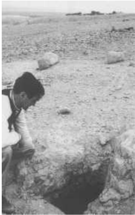
33 A cistern cut into the desert floor on the rocky terraces near to the Qumran ruins. Water control and storage were vital to the survival of such a community.