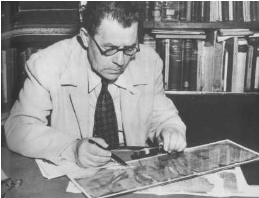
4 Professor Eleazar Sukenik, who in 1947 was the first Israeli scholar to obtain and translate some of the Dead Sea Scrolls.

to the attention of the Metropolitan of the Syrian Church.