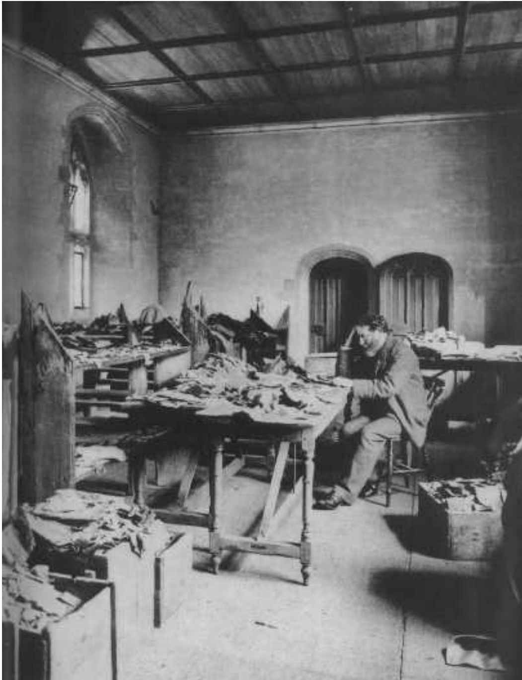
1 Solomon Schecter surrounded by boxes of the manuscripts he obtained from the Cairo geniza in 1896 and brought to Cambridge.