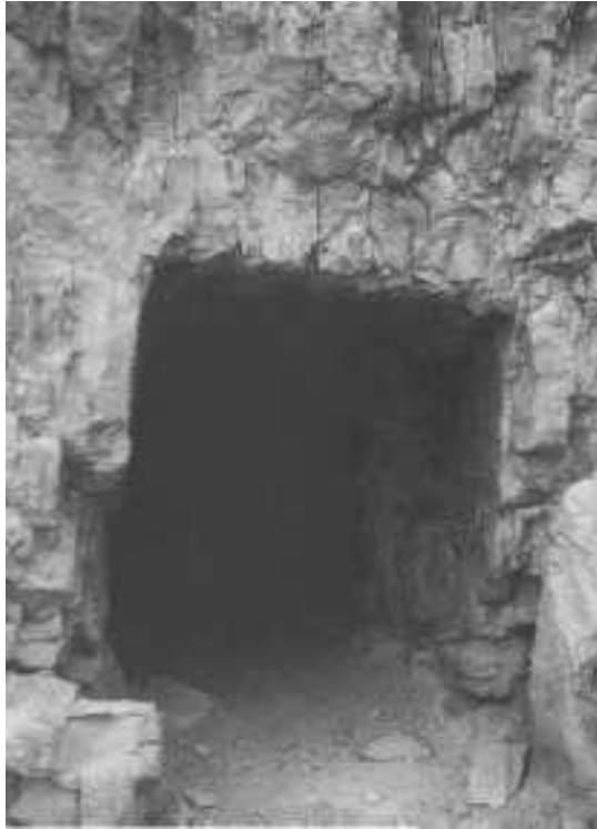
35 The exit of the water tunnel. From here the water flowed down the Waterway to the settlement itself.

in the cliff-face. The water was dammed in the Wadi and directed through this tunnel.