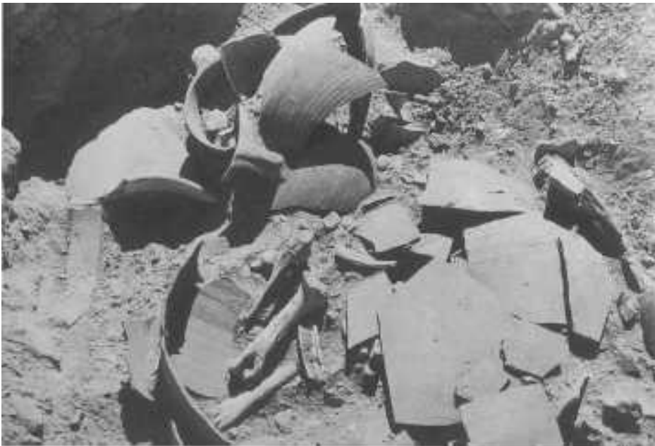
11 One of the pots containing animal bones found during the excavations and never satisfactorily explained. They appear to be the remains of sacred meals.