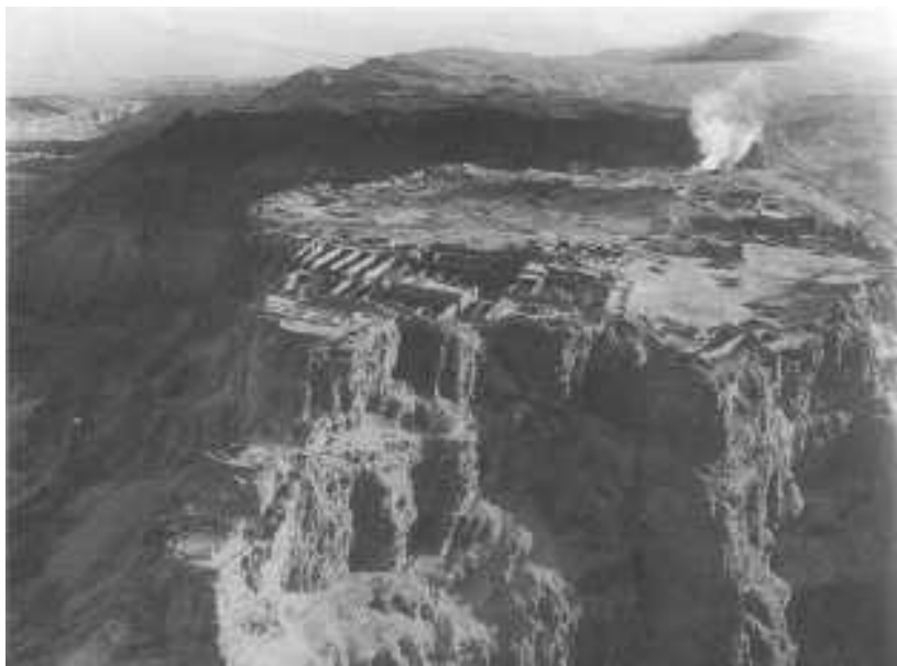
40 The ruins of Masada where, on 15 April 74 AD, 960 Zealots - men, women and children - killed themselves rather than surrender to the Romans.

Thus the authors of the Dead Sea Scrolls may be thought of as 'Essenes', but not in the sense as defined and described by Josephus, Philo and Pliny. The accounts of the classical chroniclers prove to be altogether too circumscribed. They have also prevented many modern scholars from making the necessary