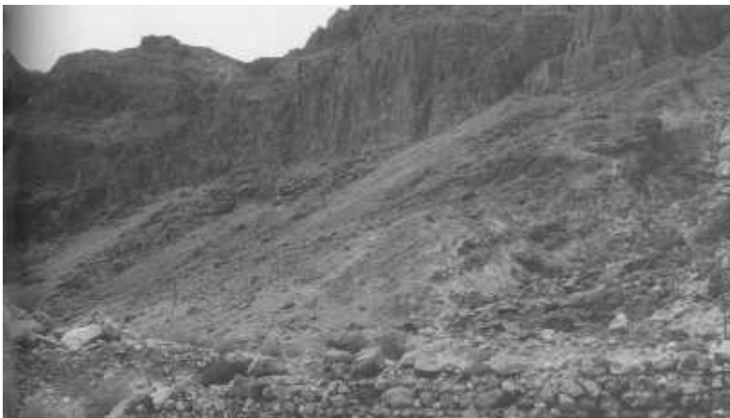
38 Ruins of a settlement at En el-Ghuweir near to the graves. The ruins have been dated to the Herodian period.

The caves in the Wadi and cliffs behind may well have served as repositories for the same type of scrolls as were found near Qumran.